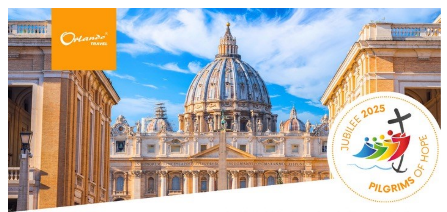
PILGRIMAGE TO POLAND AND ITALY | 16 DAYS